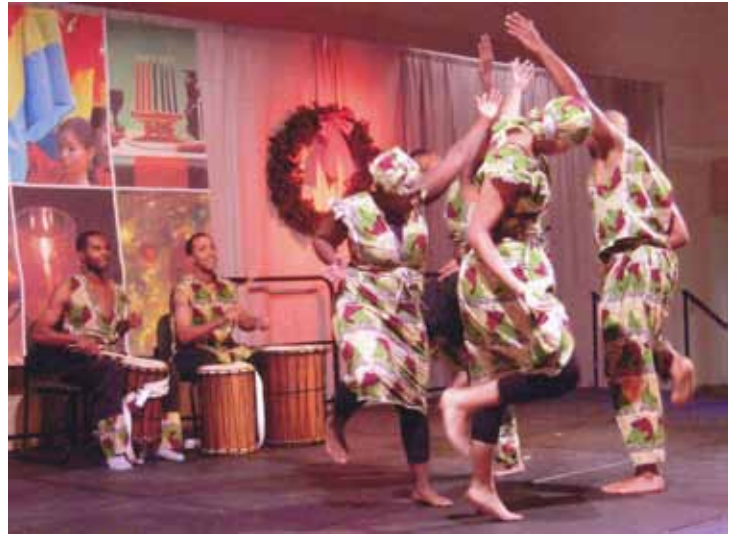
Ajula Performance Troupe at a Kwanzaa program at the University of Wisconsin Milwaukee.

Alcott Park ASME Conference Assurant Health Boys & Girls Clubs Sparks Business Journal Cedarburg Preservation Society Delco Johnson Controls Just Personal Service Kindercare Kohl's Metroparent Kids Fest Milwaukee County Zoo Milwaukee Public Museum Pfister Hotel Professional Events and Consulting Shullys Catering & Cuisine State Fair Park UWM VISIT Milwaukee Wauwatosa Civic Celebration Wisconsin Credit Union League Young President's Organization of Wisconsin