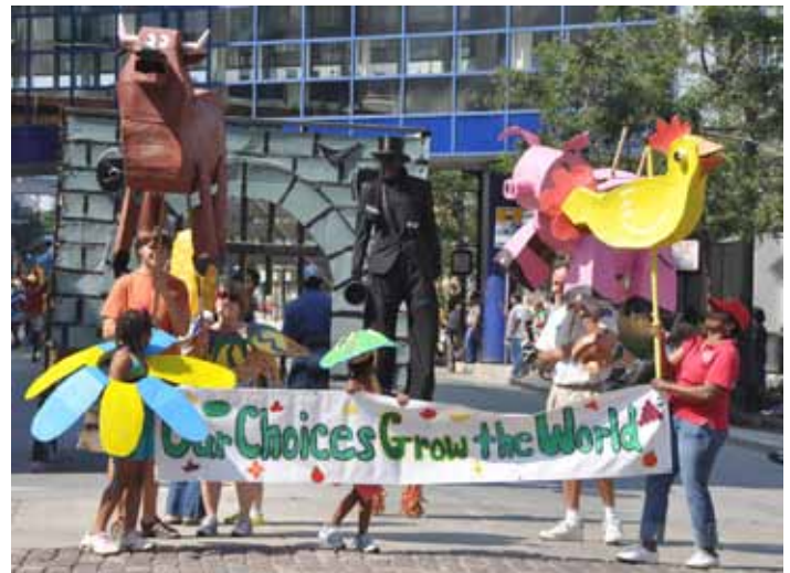
The All-City People's Parade moved down Wisconsin Avenue as part of Laborfest. The Pageant was also performed at the lakefront festival grounds on September 7.