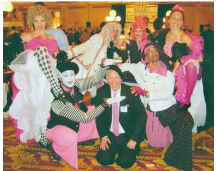
MPT cancan dancers, a classic mime, a juggler, chef, Louis XIV and Marie Antoinette entertained guests at the Business Journal's annual Book of Lists event.

Summer 2009 saw Milwaukee Public Theatre creating unique event entertainment with a vibrant assortment of strolling patriotic characters, circus performers, historical characters, swashbuckling pirates and much more.