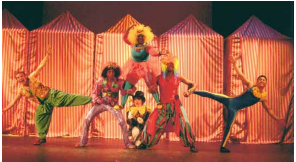
Spectacolo! MPT's high-energy circus theatre production about teamwork and creativity was performed at Lincoln Center of the Arts in the spring of 2009.

2009...Milwaukee Public Theatre's 35th year. We again reached a highly diverse audience of over 100,000 with 1,844 events (1,817 were free)...and we offered 13 stage or touring shows, four (4) major projects, including a new large scale community arts extravaganza, worked with 55 agencies to provide 141 educational arts residencies, partnered with hundreds of schools, community-based agencies and businesses, helped to sponsor a special project to counter stereotypes of people with disabilities, and took part in major community festivities, including the first annual All-City People's Parade and Pageant. All this despite financial challenges. And we have exciting plans for 2010!