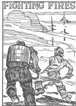
U.S. Forest Service Training Booklet, Woodsmanship for the Civilian Conservation Corps, 1937. Public Domain.

Much of my "retirement" in Richfield, WI, is spent as a public speaker on the CCC in Wisconsin and writer of biographical historic plays. As a contributing writer of Camp We-Kan-Tak-It , it is with great joy to honor with song and laughter all the men like my dad who left their imprint of CCC service upon our heritage and our landscape.