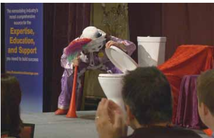
Milwaukee Public Theatre Jester plunges headfirst into corporate team building for Remodelers Advantage business meetings in Kohler, Wisconsin.