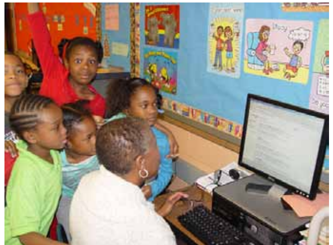
Young students at Keefe Avenue School participate in a Story Bridge workshop session.