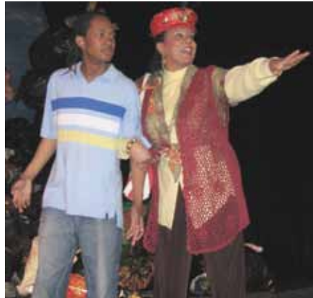
One Man's Trash is Another Man's Treasure , MPT's original theatre production about recycling, was performed at Lincoln Center of the Arts in the spring of 2010.