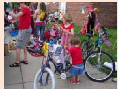
Some of the bicycles decorated for Gordon Park’s July 4 Energy Independence Day.

AIDS Walk Al’s Run All-City People’s Parade with Laborfest Bay View Bash Bay View “Chill on the Hill” at Humboldt Park Champions of the Arts Celebration Community Art and Funk Festival Dia de los Muertos Parade Fourth of July celebrations: Alcott Park and Hart Park Gordon Park Energy Independence Day Indian Summer Festival Juneteenth Day Holiday Parade Lanterns for Peace Locust Street Festival Memory Walk, Alzheimer’s Assn. National Night Out: Kosciuszko Park and Hillside South Shore Frolic Parade Summer of Peace Summerfest Kids’ Day UPAF Ride for the Arts Walk to D’feet ALS