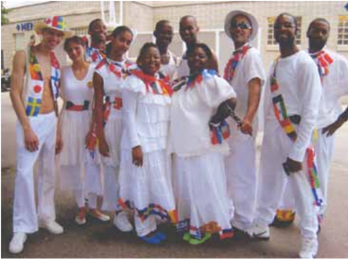
Ajula Performance Troupe perform at the annual UPAF Ride for the Arts.