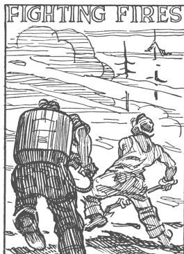
U.S. Forest Service Training Booklet, Woodsmanship for the Civilian Conservation Corps, 1937. Public Domain.

Much of my "retirement" in Richfield, WI, is spent as a public speaker on the CCC in Wisconsin and writer of biographical historic plays. As a contributing writer of Camp We-Kan-Tak-It , it is with great joy to honor with song and laughter all the men like my dad who left their imprint of CCC service upon our heritage and our landscape.